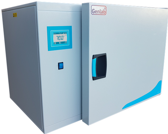
Model Shown - INC/100/TDIG/F